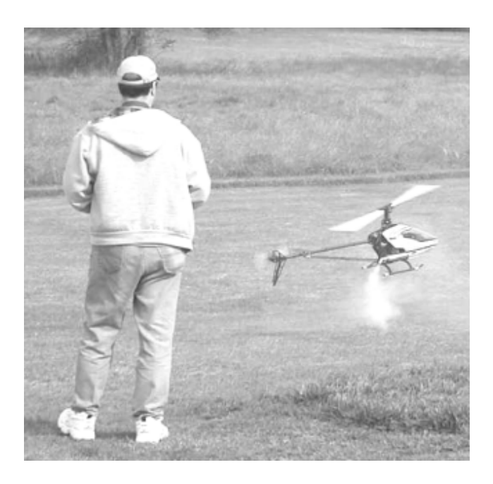
An awesome demonstration of helicopter flight was made as usual by Chuck Kluzynski.