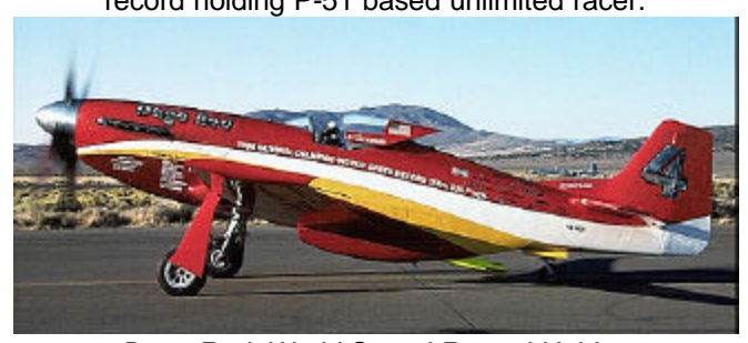
Dago Red, World Speed Record Holder.

The Santa Monica Museum of Flight also has a maintenance facility at Mojave. They operate a fleet of about twenty WWII warbirds including Spitfire, Sea Fury, P-51, Zero, Yak-3, P-47 and so forth. All of them are kept in flying condition and regularly operate out of Mojave. They also operate Dago Red the world speed record holding P-51 based unlimited racer.