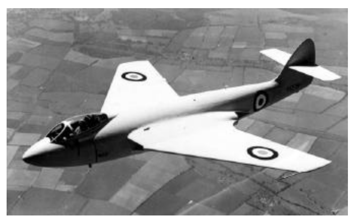
Hawker 1052 with straight tail clean wing and armpit exhausts.

This was a time of vibrant aviation development as the British companies vied to produce the next generation jet fighters. During the course of exploring the design features necessary to fly at supersonic speed, each manufacturer engaged in frantic development. In 1953 Hawker and Supermarine fought a continuing duel for the World's Speed record. Both had learned that swept wings were more conducive to managing the aerodynamic effects of critical Mach number flight and they rapidly developed swept variants of their fighter candidates.