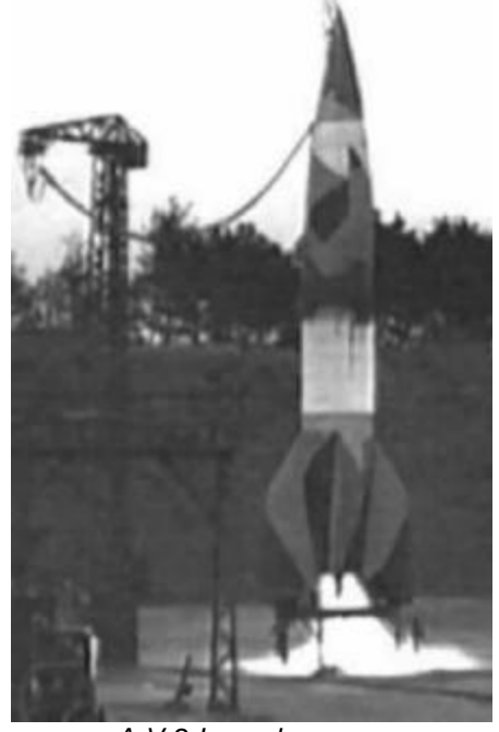
A V-2 Launch

Of course you couldn't hear the V2 and one of those landed about a half a mile from our house. It broke every window in the area, destroyed five houses and killed one of my gradeschool classmates. My cousin and I were in a one-story store about 200 yards from the impact. The place collapsed on us but we were OK. After all. this was the normal life a small kid lived in those times. mother stood with my brother in a stroller outside a shop widow. The blast took the glass into the store! Yes this too is part of aviation. let's forget that the war machine has been the engine driving it.