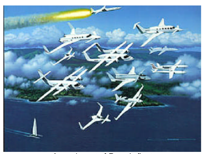
An early part of Rutan's fleet.

Burt Rutan's operation is the most productive airplane factory in the World. In the last twenty years they have designed and built and flown over thirty different airplanes.