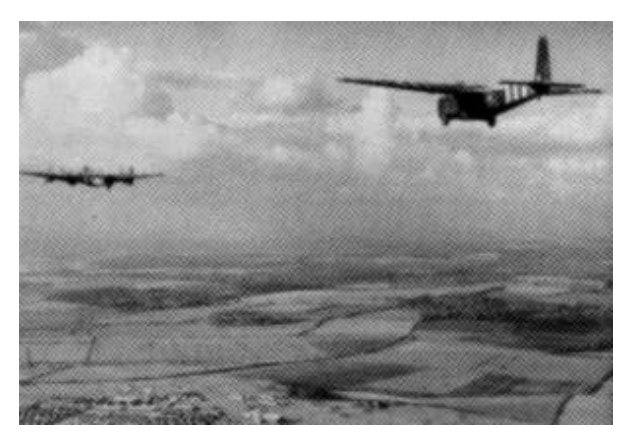
A Lancaster towing a Hansa with invasion markings. I couldn't find an Arnhem picture

One such clear memory was the sky filled endlessly with airplanes towing gliders, probably on their way to Arnhem. There were, in my memory, smaller transports towing single gliders and larger ones towing two, side by side.