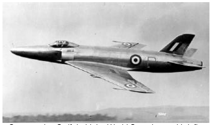
Supermarine Swift held the World Speed record briefly.

Following my apprenticeship I sailed to the New World to seek my fortune, ending up at Boeing Vertol in 1962, but I digress.