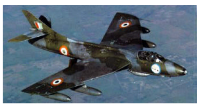
The Hawker Hunter

I got the model airplane bug in the late 40's about the time I attended Enfield.Grammar School (founded 1553). Enfield is the location of the famous arsenal, you know the Enfield rifle but you probably don't know the ADEN 30mm cannon, which was so effective in the Hawker Hunter and surprisingly, the round from this cannon is currently used in the Boeing Apache helicopter! Enfield also had an excellent model airplane club in which my early ideas flourished.