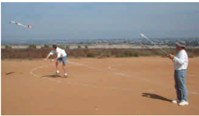
Second place Tomas Pils launches for Winner Steve Neu.

be stopped during the flight through the course to and around pylon B and back. It can then be turned back on for a climb and dive to do it again, however, since only ten power-on cycles are allowed the models actually fly two complete laps power off before powering to altitude and diving again. In the time limit of 220 seconds for this part of the flight competitors have made up to 39 laps (a lap is considered A to B and a round trip is two laps!).