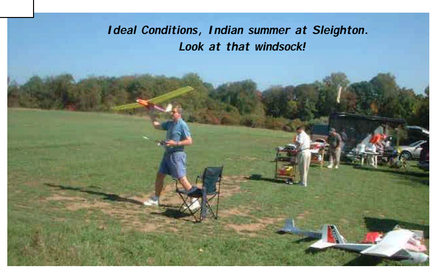
The Flightline 1