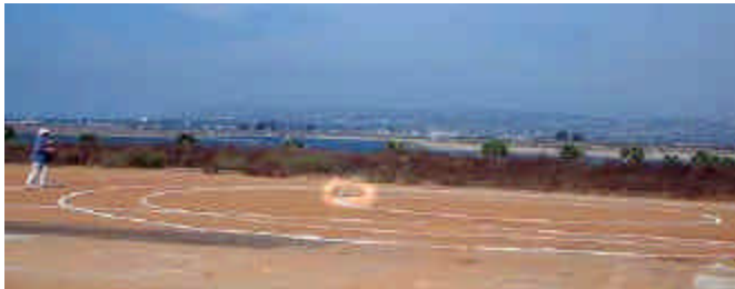
This spot landing just missed the center bull's eye (model highlighted)

The final task is to end the flight at exactly ten minutes and land within the bull's eye. This seems really tough, as you have to manage the model's flight altitude, distance and speed to match the clock then put it on the ground so it skids into the center of the bull's eye! Sounds impossible to me but this is what they do time and again. This is also used as the end of flight scoring system for the thermal duration towline glider community, so it can be done by mere mortals, but not me.