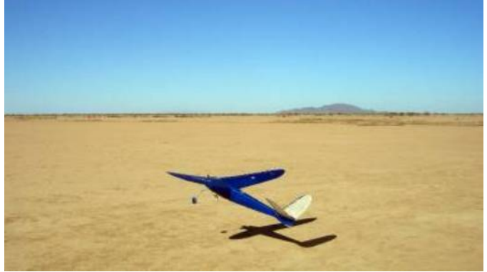
It fired up and he released it into a fine takeoff. But it didn't stop there, it completed the loop as I continued to take pictures. It was a tight loop and I didn't see it come around behind us for the second pass; a close one! On the second turn it hit the ground quite close to us. A real scare that causes you to shake after it is over and you think about what happened and what might have been.

Eut was using a Spektrum 2.4 GHz radio .