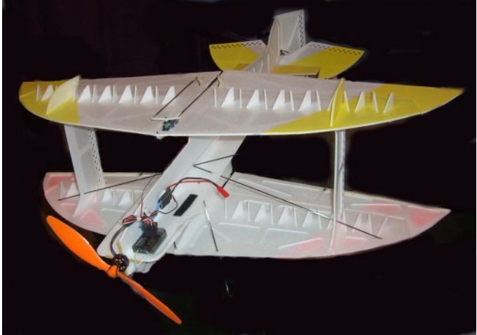
Of course foamy 3Ds were everywhere, but you expected that. However this one seemed rather high tech. It was one of

those flown by the experts at the various professional indoor demos.