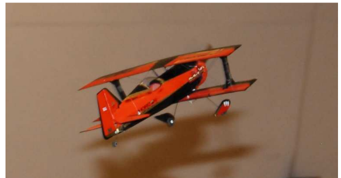
E-Flite's UMX Beast is a handful in the gymnasium, but lives up to its name – a great backyard flier

The offerings for indoor flying continue to impress as the electronics get smaller, and the batteries chemistry improves. Horizon Hobby continues to have some of the most popular models at the fly-ins including the new Night Vapor, and the micro T-28.