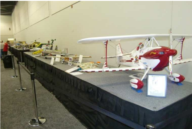
Some of the models entered in the Concours competition.