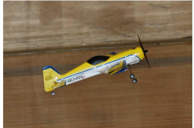
The new micro-Sukhoi SU-26XP includes a new motor, prop, better control throws, and improved CG