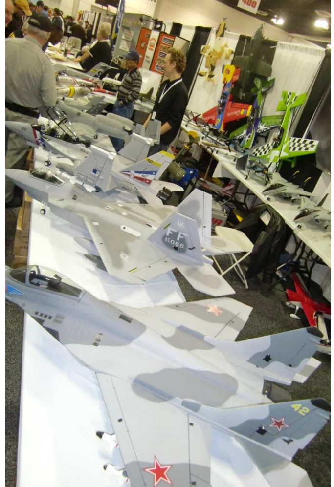
A supplier of large and huge ducted fan models.