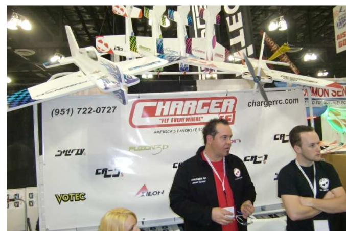
A supplier of flat fish 3D models featuring a large sized edition shown in the display.