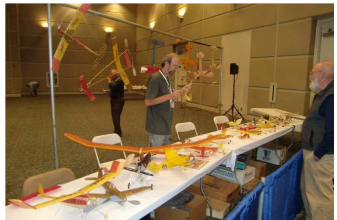
The Black Sheep Squadron club with their indoor free flight models and the build a model area (well they do it but I didn't capture that bit)