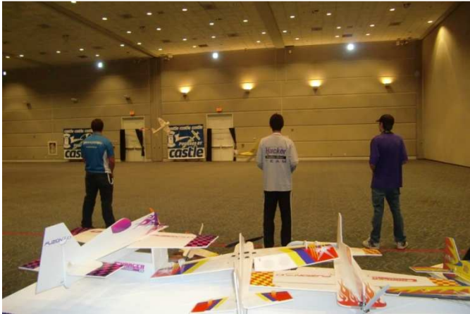
The other indoor flying area with the RC models, mostly 3D doing rolling loops etc.