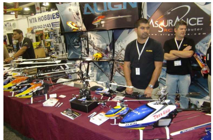
The Align stand for our heli guys.