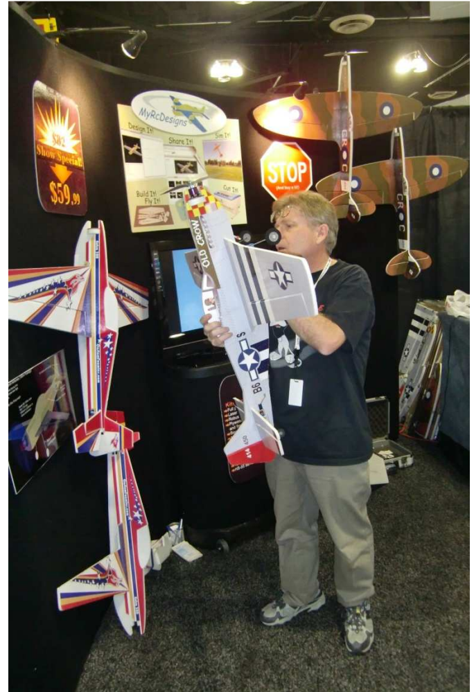
The MyRcDesigns stand with their large size flat fish scale warbirds. The look quite good at $59 check their website. They have a CAD program on it specially designed for flat fish model airplanes. Design one and they will laser cut it for you.