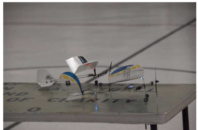
A table made a great make-shift carrier – the Vapors and Embers had the best luck at landing