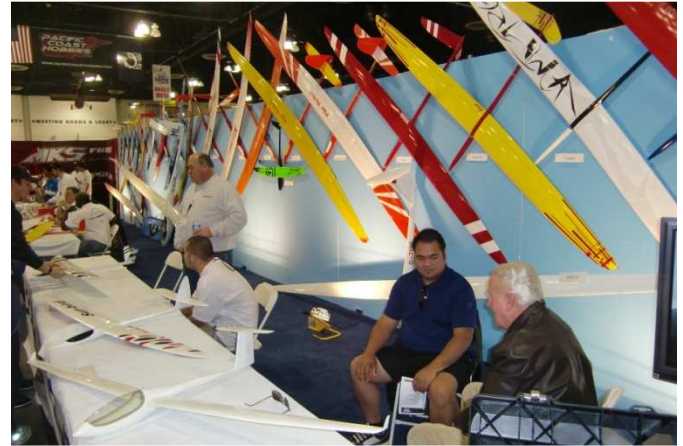
Gliders USA, and how!