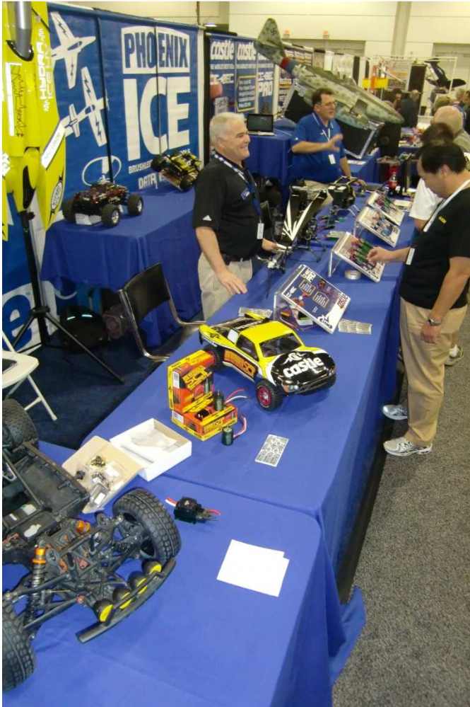
The ESC side of the stand.