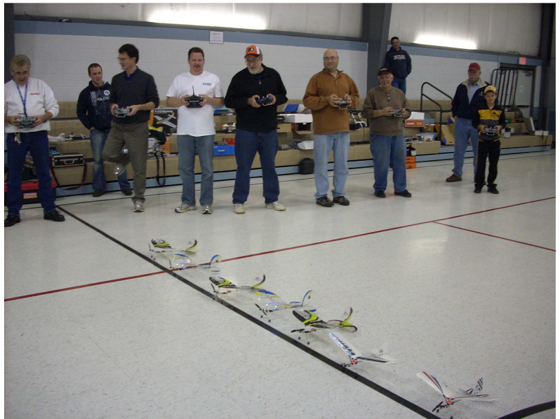
Pylon racing is one of the new events this year. The Embers and Vapors compete for the slowest time, while the T28s and P51s go for all-out speed

Beginners using due caution and respecting club rules may fly GWS Slow Stick or similar models without instructors. The club also provides the AMA Introductory Pilot Program for beginners without AMA insurance.