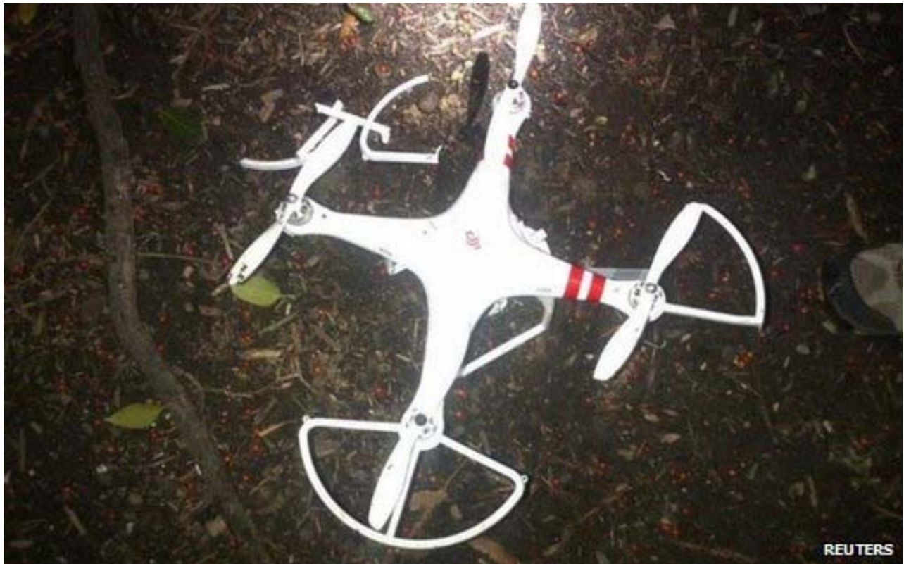
The Secret Service found a DJI Phantom drone on the White House's south lawn

From BBC News website; http://www.bbc.com/news/technology-31023750