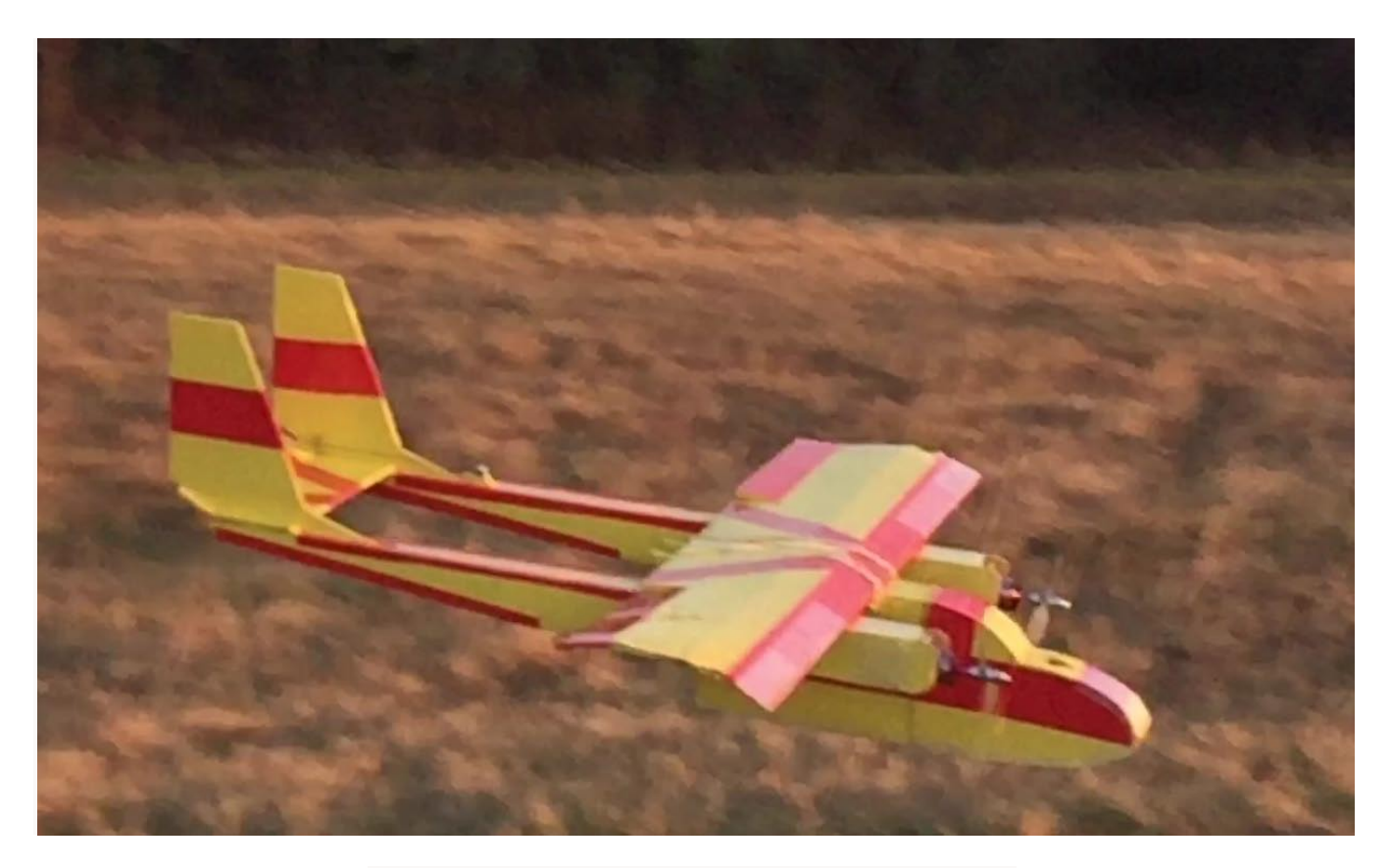
See Pedro's excellent video of the maiden flight here;

https://drive.google.com/file/d/0B65EUjJ0LT5KTnVsdGRjQVZ6OWc/view?usp=sharing