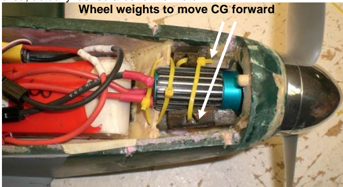
Wheel weights to move CG forward

Thinking through the results of the flight my conclusions were that it was still stable in pitch, as it did not diverge throughout either flight but the roll axis was not stable. Even a small input produced a large roll response and over travel. I thought that if I further reduced the roll travel I might be able to control it. But in the meantime I redid the CG location calculations. I had been balancing the model on the wing aerodynamic center, a location that should be stable but I decided to move the CG forward for the next flight and so added a couple of wheel weights to the nose area; actually lashed around the motor!